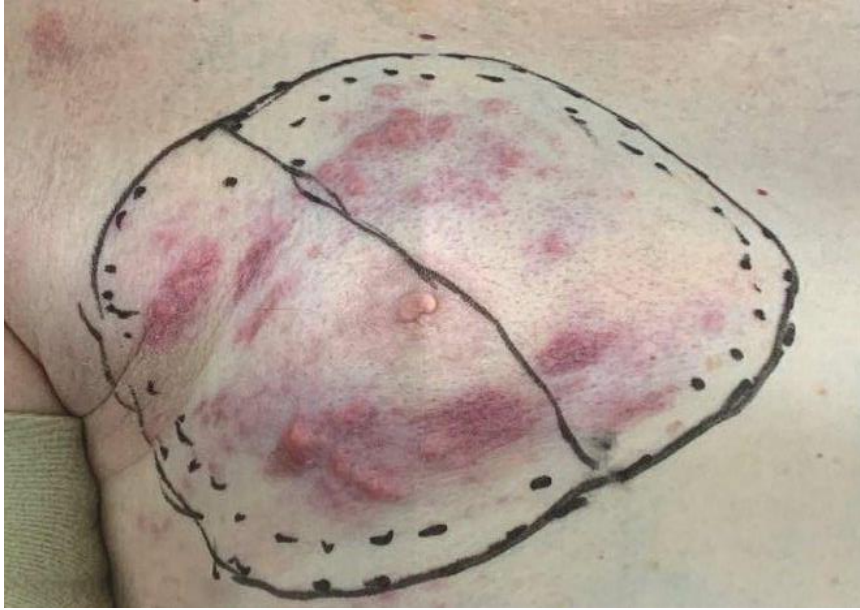
Figure 1. Multiple flesh coloured firm nodular lesions circumferential pattern on right pectoral region.